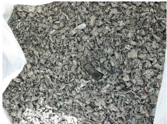
E 40 Shredded Scrap E46 Incinerator Shredded Scrap