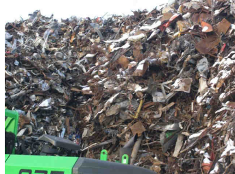
Scrap Metal HMS 1&2 (80:20) Heavy Melting Scrap